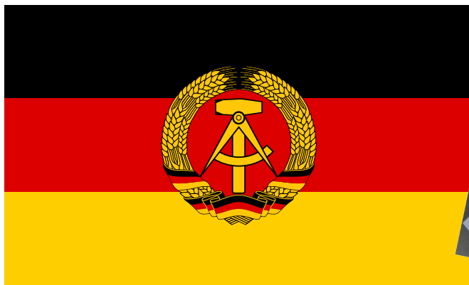
"Flag of East Germany" by Jwnabd / public domain