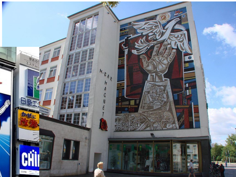
Image Eisenhüttenstadt