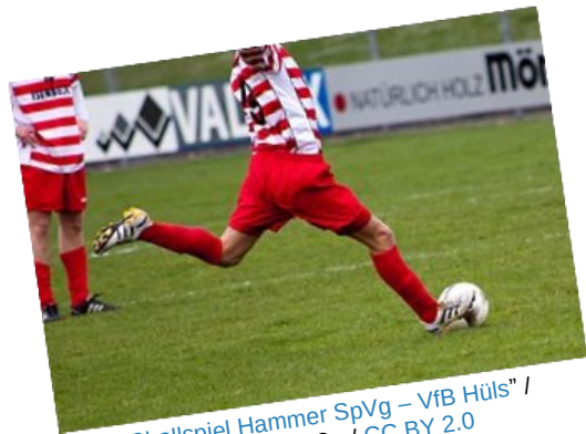
"Fußballspiel Hammer SpVg – VfB Hüls"