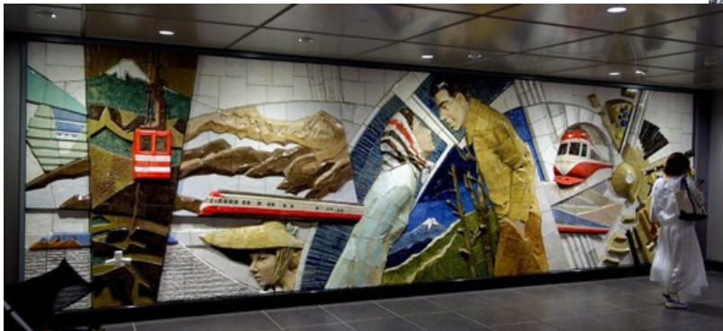
Shimokita Odakyu relief by Christian Horn / CC BY 3.0