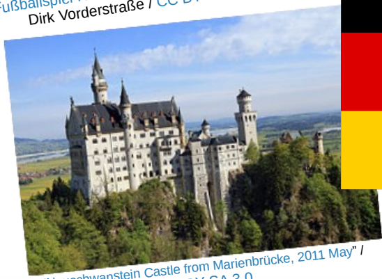
"Neuschwanstein Castle from Marienbrücke, 2011 May" / CC BY-SA 3.0