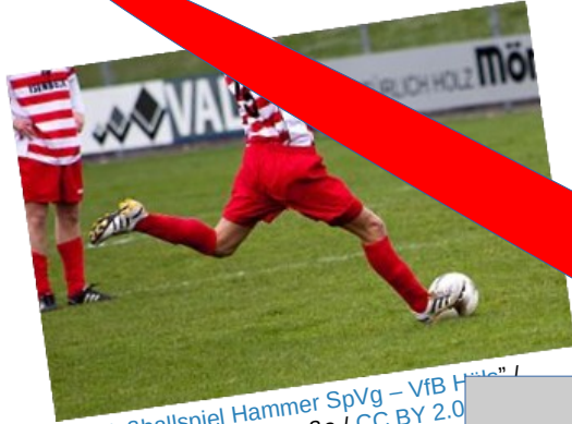
"Fußballspiel Hammer SpVg – VfB H..."