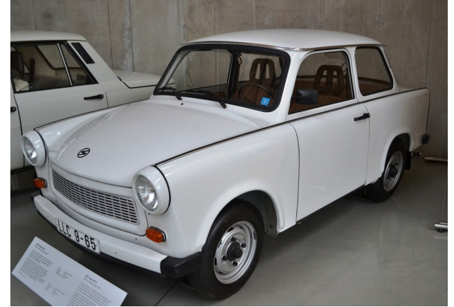
Trabant and by "High Contrast" / CC BY 3.0 DE