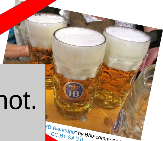
"HB-Bierkrüge" by Bbb-commons / CC BY-SA 3.0