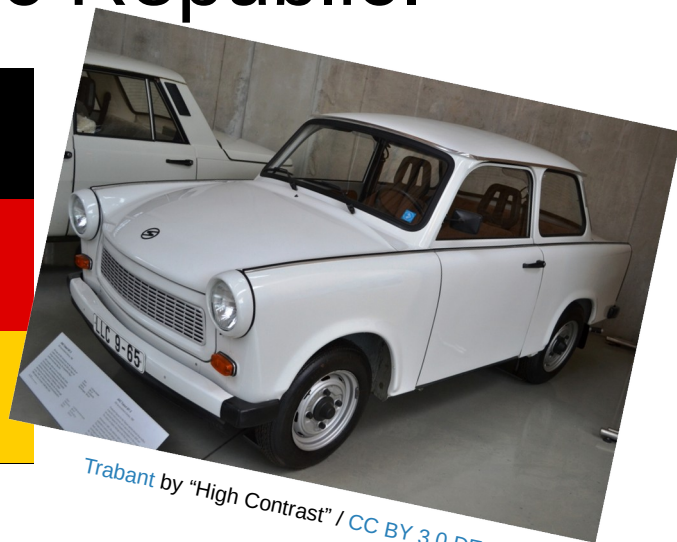
Trabant by "High Contrast" / CC BY 3.0 DE