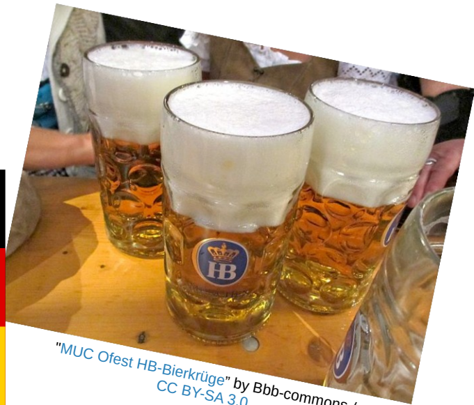
"MUC Ofest HB-Bierkrüge"