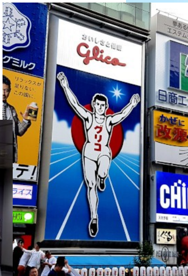
Glico by Christian Horn / CC BY 3.0