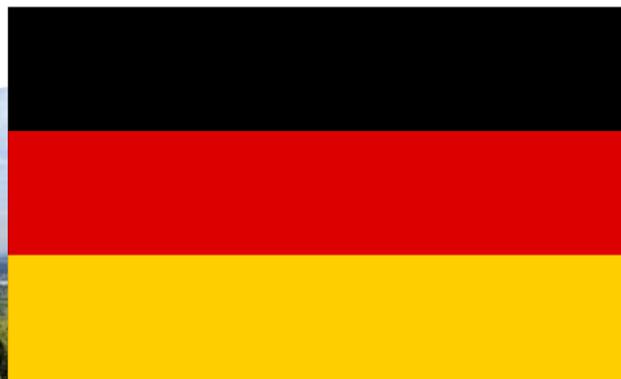
"Flag of Germany" / public domain