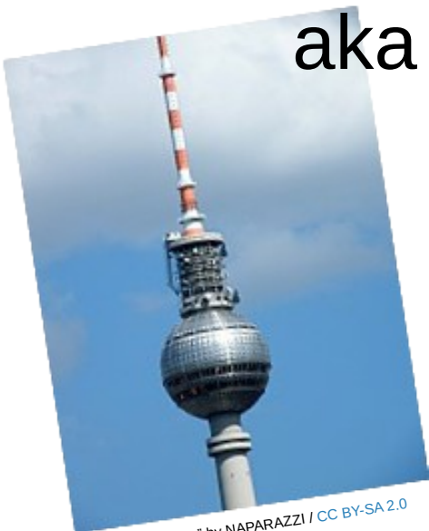
"Fernsehturm Berlin"

Former east Germany, aka German Democratic Republic.